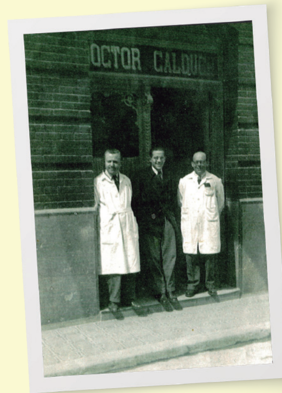
Pharmacy Calduch 1930. Villarreal.

Today, the fifth generation of pharmacists who run the current Calduch Laboratories in Castellón, continues to manufacture the Original lip balm with the same master formula as always, according to its composition from 1880, a blend of essential oils and menthol in a mineral wax base.