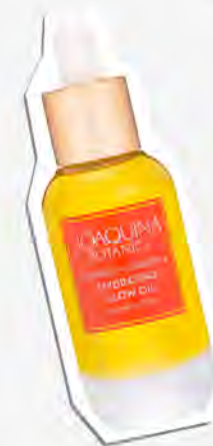
Joaquina Botánica Orquídea + Vitamin C Hydrating Glow Oil

Like a vacation in a bottle, this South American newcomer serves up a blend of superfruit seed oils—including maracuja, papaya, camu camu, and sacha inchi—along with an antioxidant-rich orchid extract. For a boost of vitamin A, there is also bakuchiol, a gentle botanical alternative to retinol.