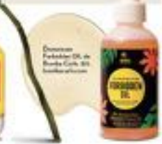
Disponible en Amazon C. Colombia. Disponible en Amazon España. Disponible en Amazon México.