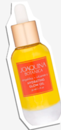
Joaquina Botánica Orquídea + Vitamin C Hydrating Glow Oil

Like a vacation in a bottle, this South American newcomer serves up a blend of superfruit seed oils—including maracuja, papaya, camu camu, and sacha inchi—along with an antioxidant-rich orchid extract. For a boost of vitamin A, there is also bakuchiol, a gentle botanical alternative to retinol.