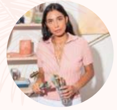
Bianca Valle Model, Nutritionist, & Wellness Influencer